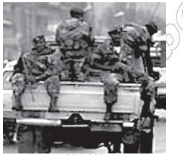
National army working for the rule of law

Common law comprises the body of those principles and rules of action relating to the existence of government, security of persons and