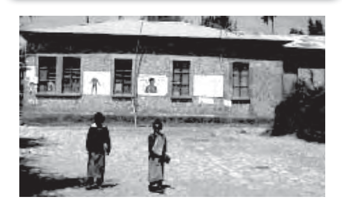
Education is important for rule of law to be effective

What is the difference between rule of law and absence of rule of law? Discuss as a class.