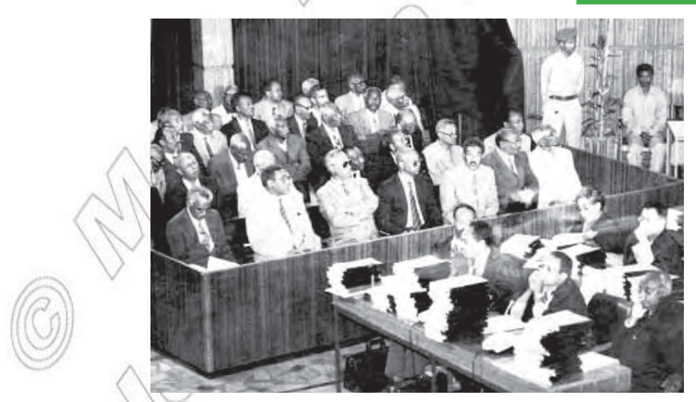
Members of the Derg government brought to trial for their violation of rule of law